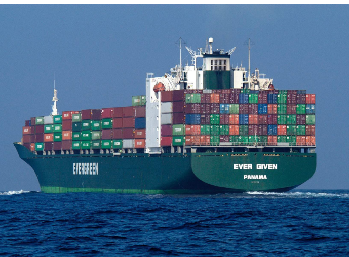
INTERIOR DESIGN 2020