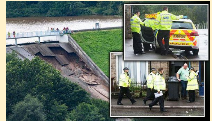
Whaley Bridge 2019

By LUKE CHILLINGSWORTH PUBLISHED: 06:52 PM BST 01 AUG 2019 | UPDATED: 06:44 PM BST 01 AUG 2019